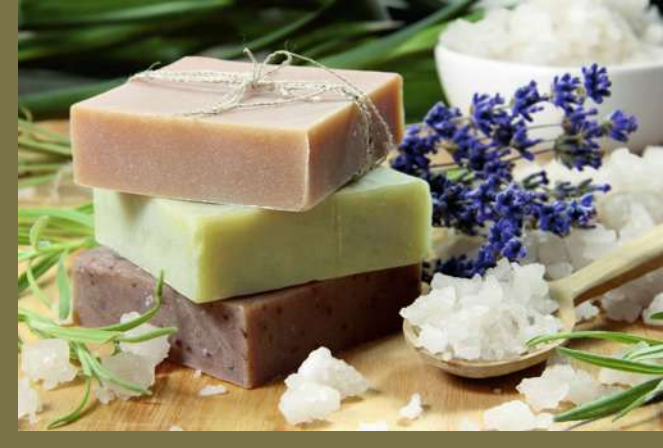
16 soaps out of that level. Each soap would be consisting of 80 grams.

According to the above mentioned ratio and quantity we can manufacture only