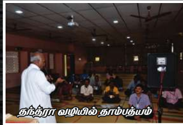
தந்திரா வழியில் தாம்பதியம்