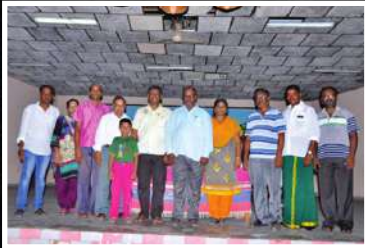
22.10.2017 - Kanchipuram.