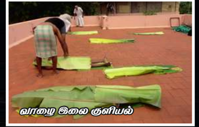
வாழை இலை குளியல்