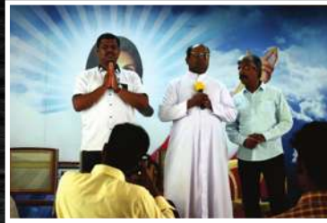
14.10.2017 - Coimbatore.